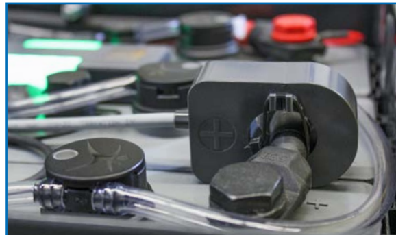
Optional: also available without a current measuring head.