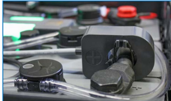
Optional: also available without a current measuring head.